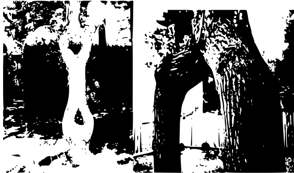
Figure 2. The organic quality of quantum haecceity.

Another, more qualitative way to get a sense of this notion of QH is in terms of organic systems. It is well known that trees of the same type, originating from distinct seeds, can merge into effectively a single entity (see Figure 2).