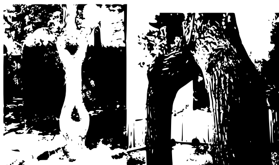
Figure 2. The organic quality of quantum haecceity.

The trees shown in Figure 2 have been deliberately coaxed into the forms shown, but trees in nature also naturally merge and separate given the appropriate conditions. The analogy with our current topic is that the saplings share identical essences but differing haecceities corresponding to their cardinality: specifically, there are N saplings. On the left, two saplings have been planted and coaxed into joining to form a collective entity of the same essence, with the potential to diverge and reunite again, which has occurred. Without the haecceities corresponding to their number, they would have no potential to converge and to diverge as shown, since there would be only a single entity.